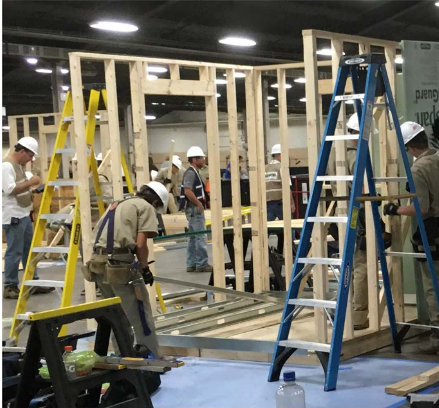
One wall is framed using steel studs

This year 48 teams competed in two categories: 34 in high school and 14 in Post-Secondary. Their mission was to build an 8 foot by 8 foot structure “kitchen”, then plumb, wire, and apply brick per plan.