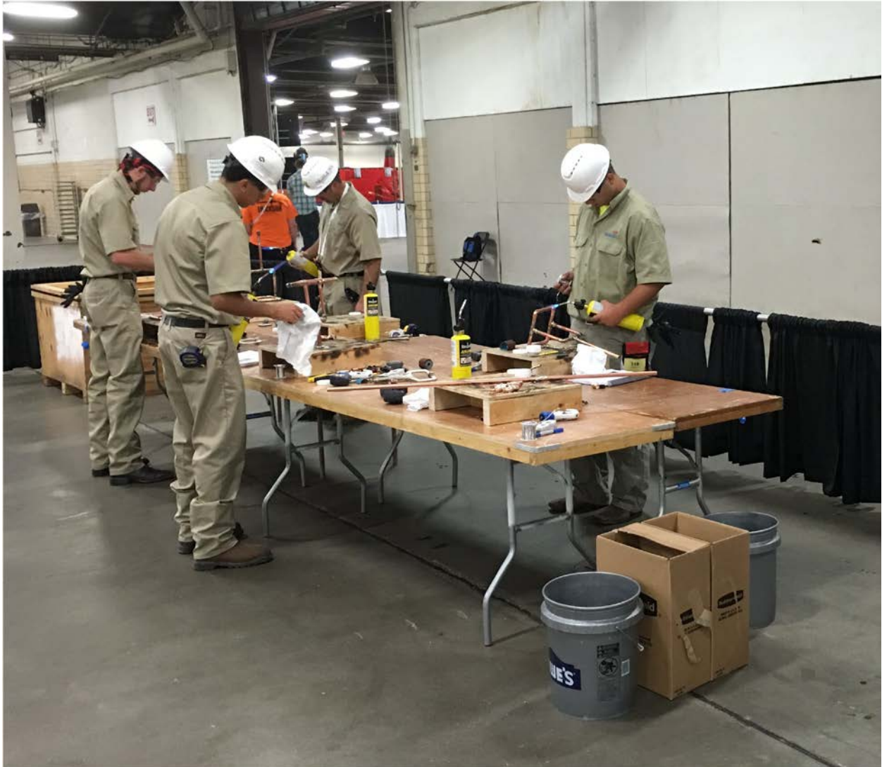
Contestants demonstrating their plumbing skill at the plumbing skill check station.