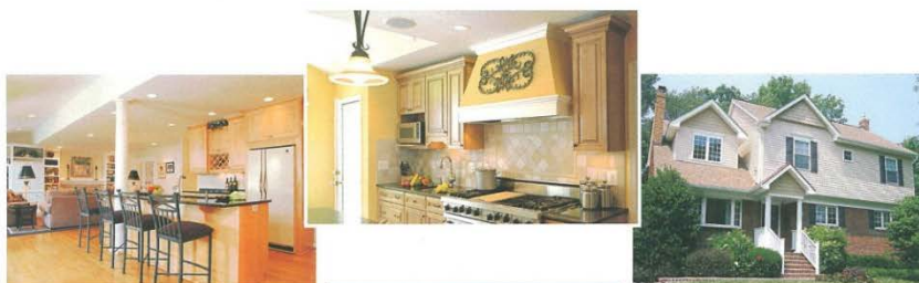
*Photographs did not appear in magazine.

This design/build firm does projects large and small, with a specialty in great rooms.