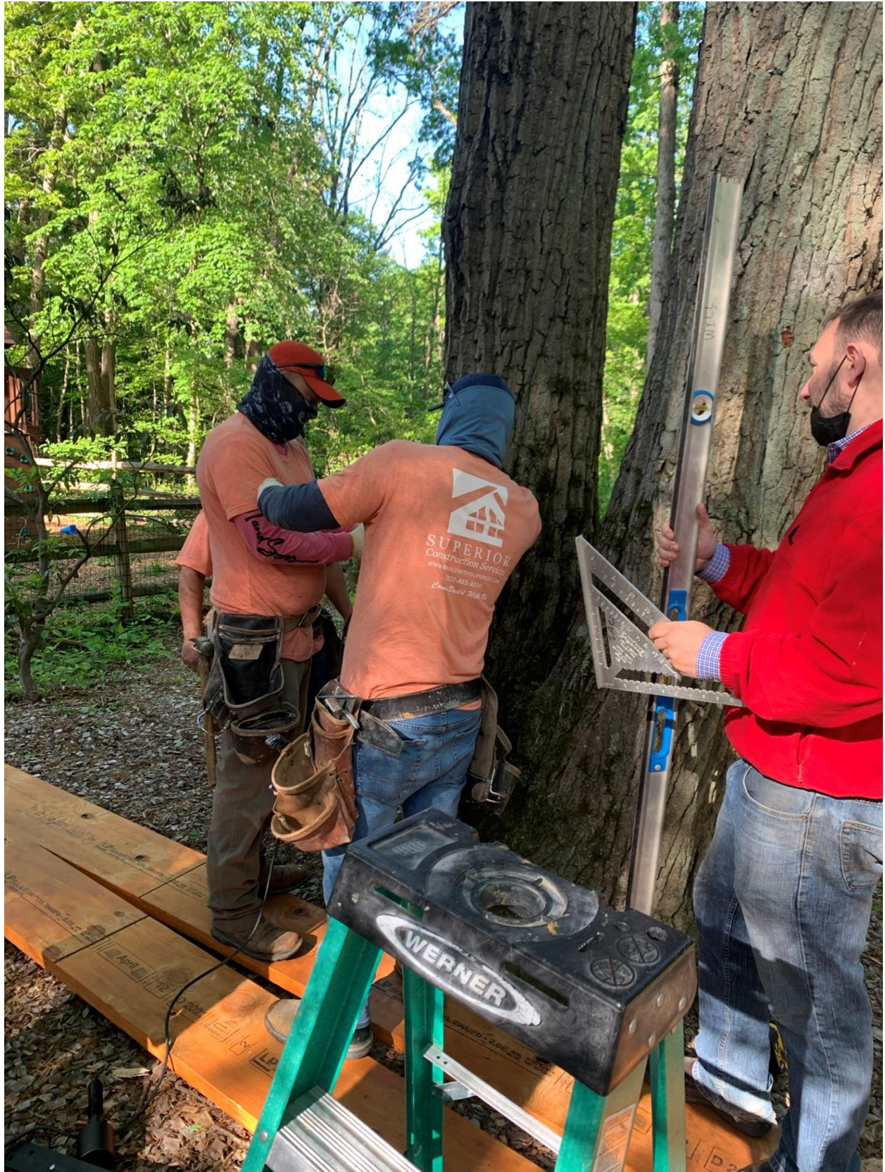
Tree House Hardware Installation.