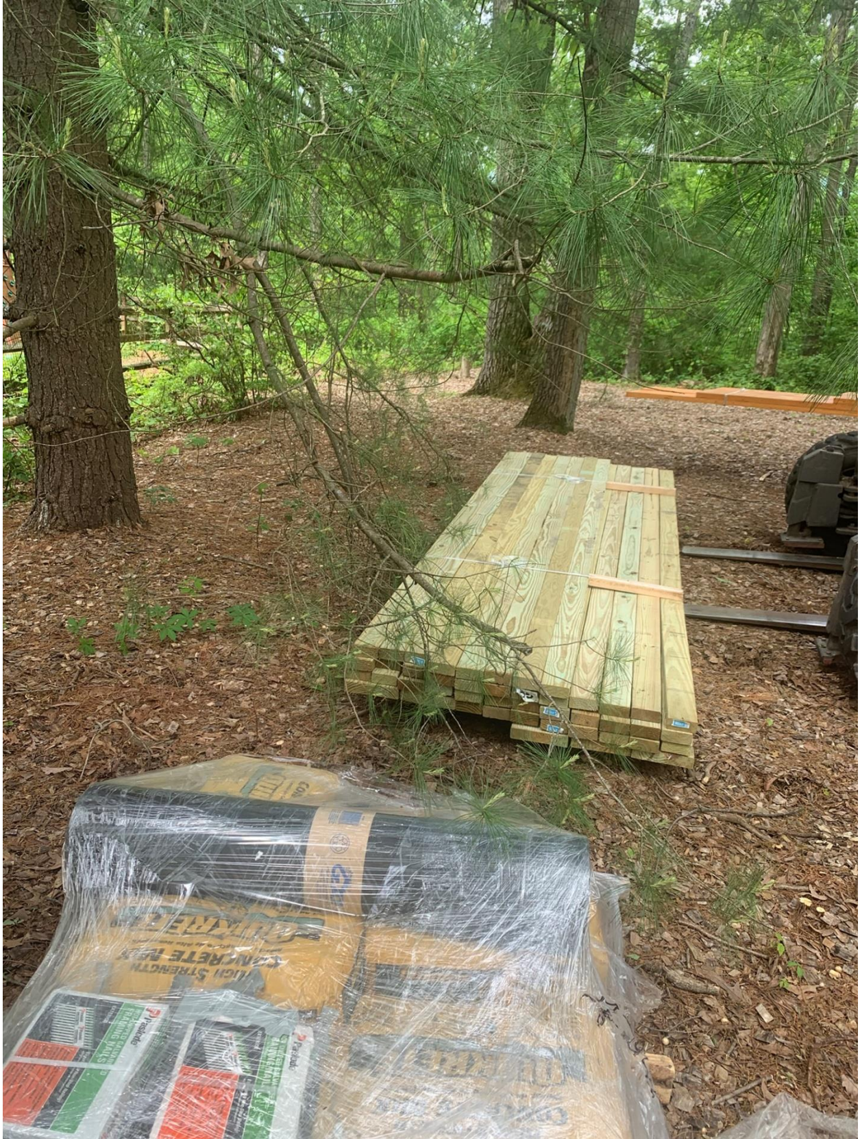
Tree House Site Pre-Construction Thank You Barron's Lumber 😊