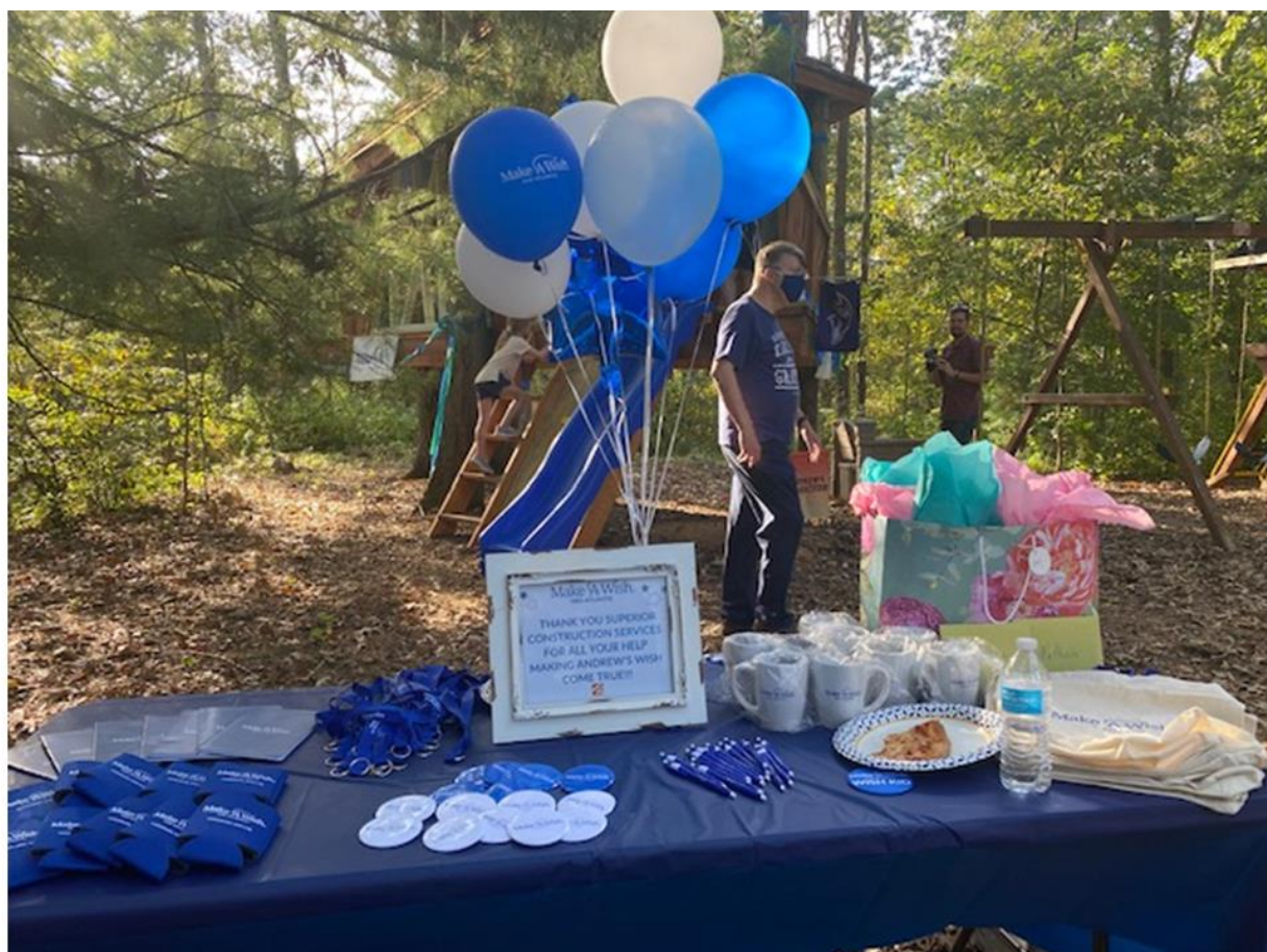
Andrew's Day 😊 A Wish Come True