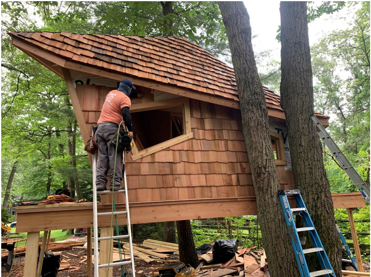
Angles and Angels 😊