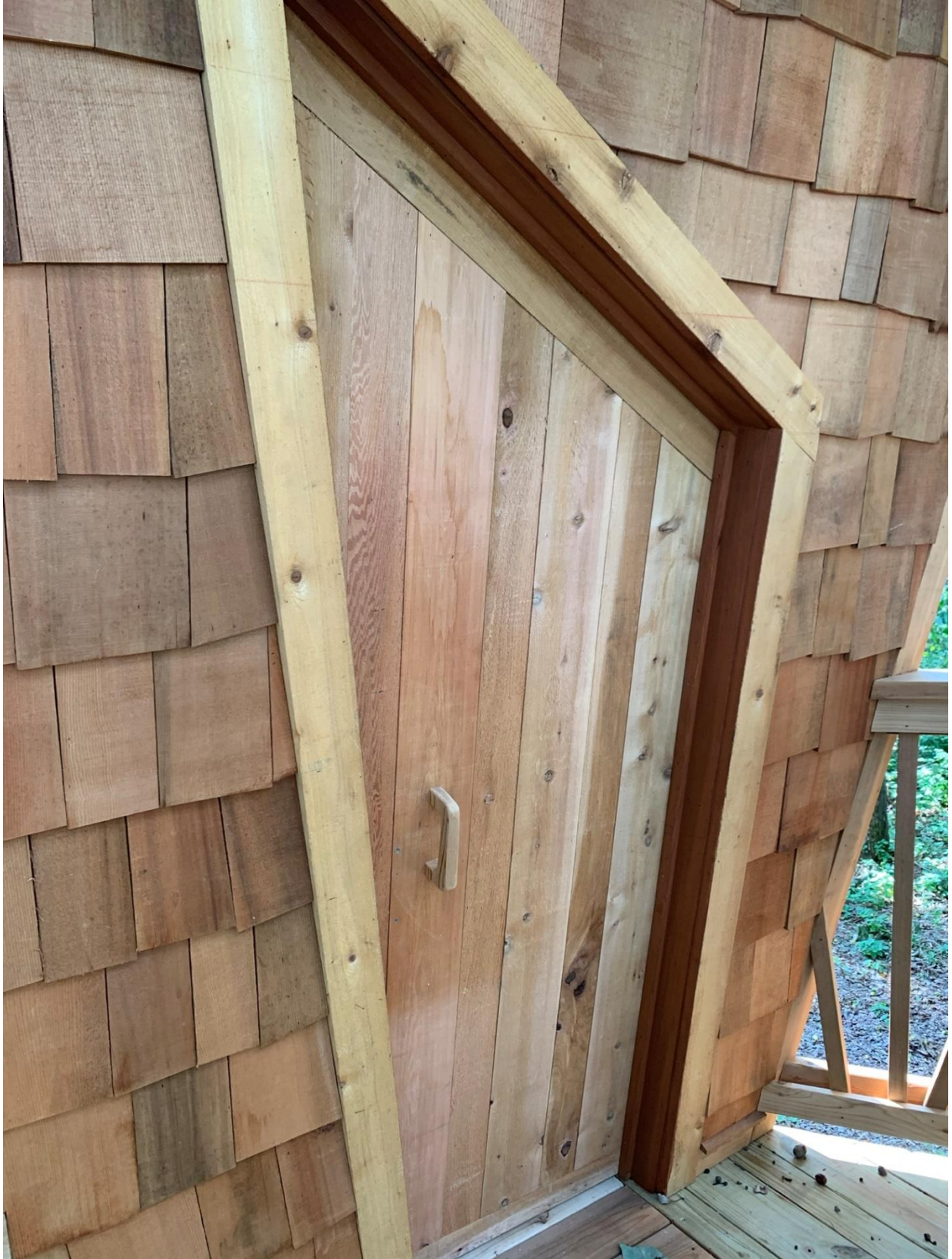
Entering into a New Realm.